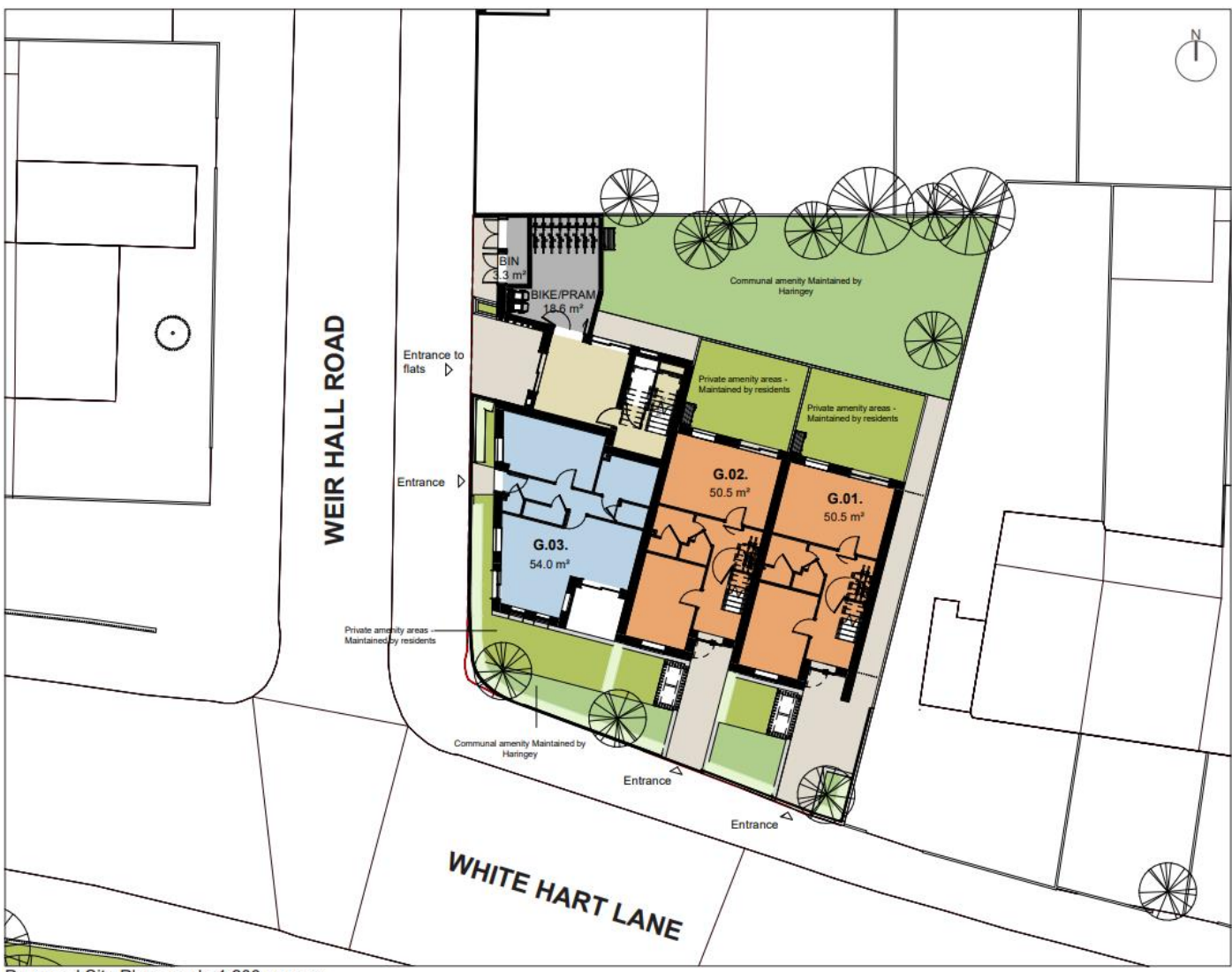
Proposed Site Plan - scale 1:200 approx

This image illustrates the proposed scheme looking west along White Hart Lane, highlighting the schemes corner focal point with Weir Hall Road.